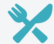
Table of ten guests of your choice which includes drinks reception, three course meal, wine and soft drinks at the table